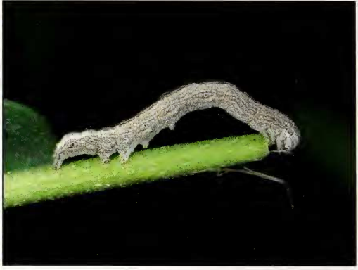
Gomera, Vallehermoso, December 2011)